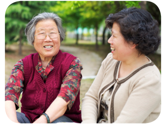
A service and support guide for carers of people with mental illness