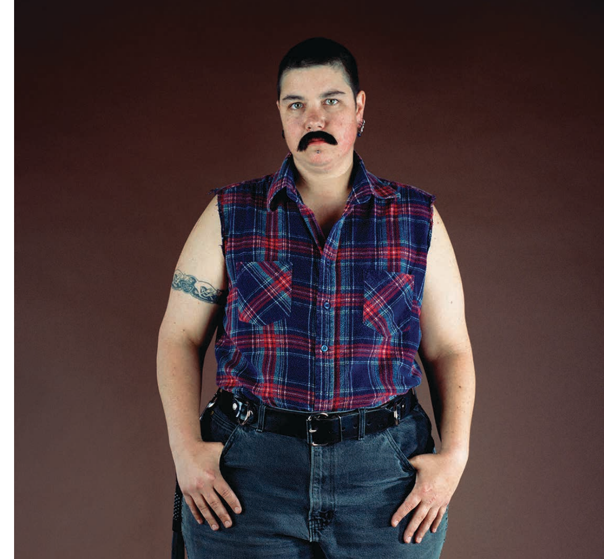
ABOVE: Catherine Opie, Bo , 1994, C-type print, 152.4 x 76.2 cm, © Catherine Opie Courtesy Regen Projects, Los Angeles and Lehmann Maupin, New York, Hong Kong, London and Seoul.