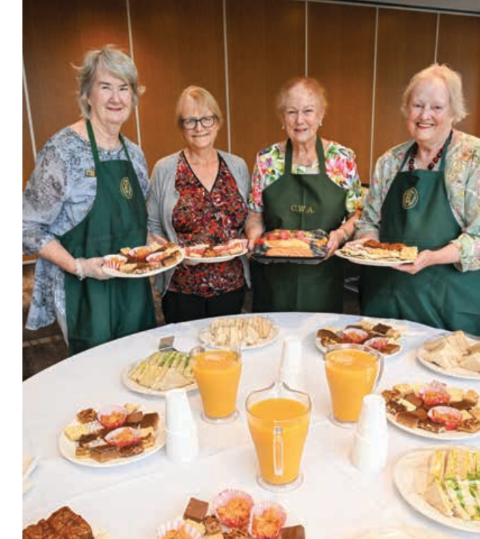
ABOVE: Friendly smiles all round — members of Donvale CWA.