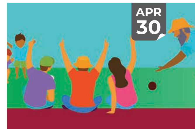
LEFT: Enjoy spectacular views and nature. ABOVE: Document wildlife in your neighbourhood. RIGHT: Join the party to celebrate Templestowe Bowling Club.