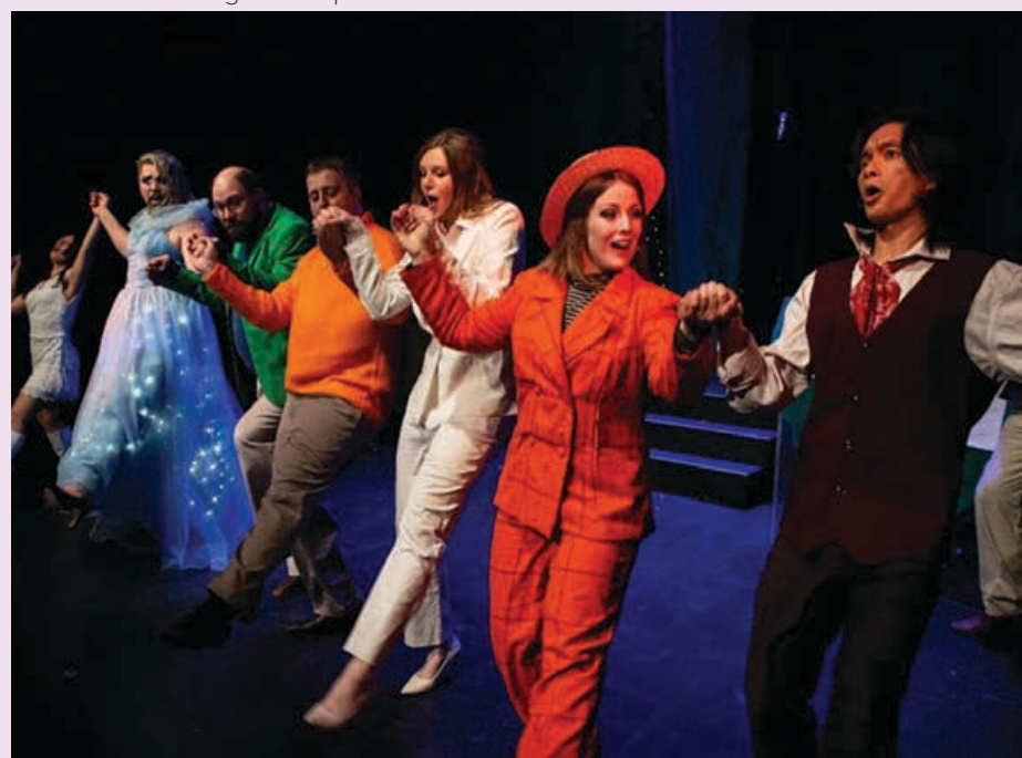
BELOW: Waterdale Theatre Company's As You Like It