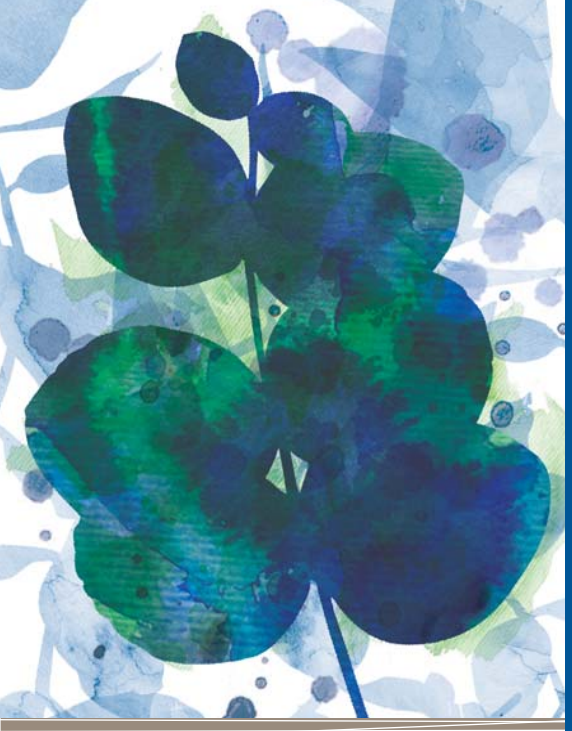
Fitness at Finns & Walking Westerfolds Finns Reserve to Westerfolds Park Walk